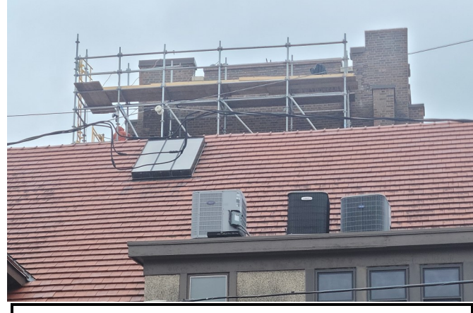
North side—picture taken from the parking lot.

South side—picture taken from UP's parking lot