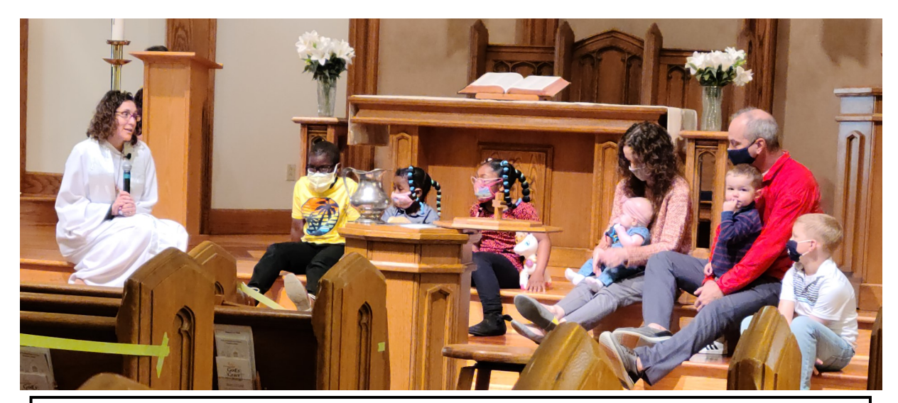
Children's time at our first in-person service on March 14, 2021