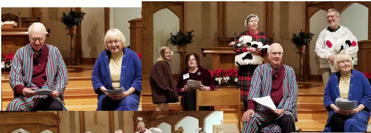
Joseph & Mary, animals, angels, shepherds, wisemen, stars, and the baby Jesus.