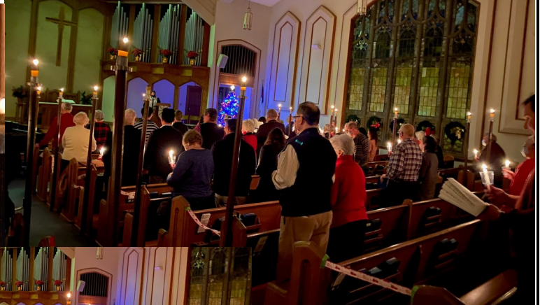
2021 Christmas Eve Service