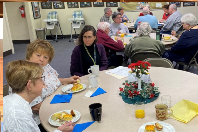
Ash Wednesday service, following our first Lenten Breakfast on February 26, 2020.