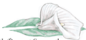
With Deepest Sympathy