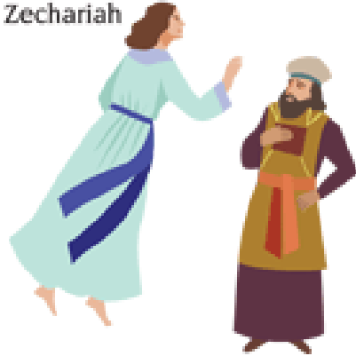
Gabriel Appears to Zechariah

Sometimes we don't recognize an angel right away. Sometimes what we think is an annoyance or intrusion is really an angel sent to tell us important information, or simply to bring us closer to God. But I best get on to my story.