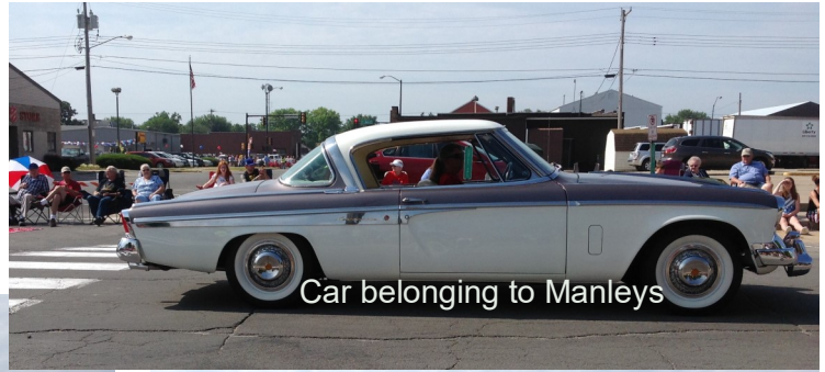
Car belonging to Manleys