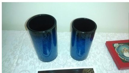
2 Cobalt Blue Glazed Pottery Vases—valued at $35