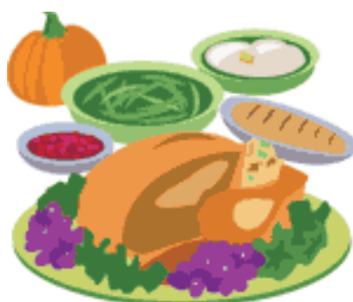
A Feast of Gratitude