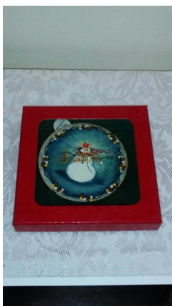
P. Buckley Moss Christmas Ornament—valued at $40