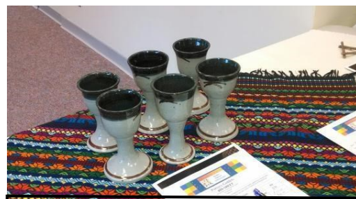
Set of 6 Pottery Goblets—valued at $50