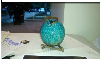
Sculpture by Pam Dennis (clay, copper, glass & wood) - valued at $50