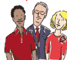
Wear Red for Pentecost

Pentecost Sunday is May 24. Please remember to wear red!