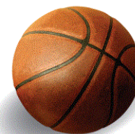
Grinnell College Basketball