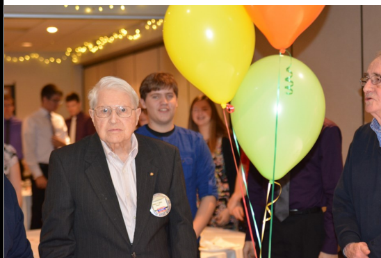
December 16 at their regular meeting.