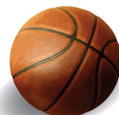
Grinnell College Basketball